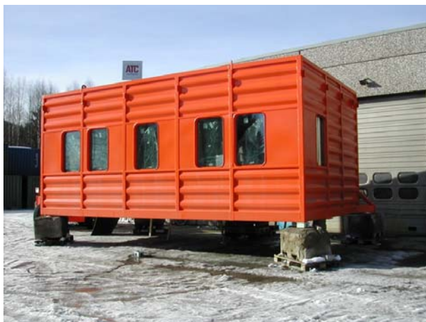
Completed coffee shop prior to delivery

The Sanitary system included full plumbing, piping and drains for the toilets, wash basins, dishwasher, coffee machines and water heater.