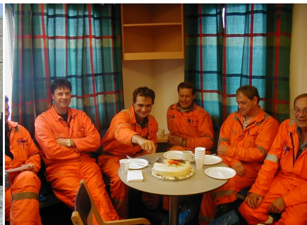
Official opening on Valhall DP cellar deck

This custom built container involves many disciplines and is a good example of the wide range of skills within Trans Construction AS.