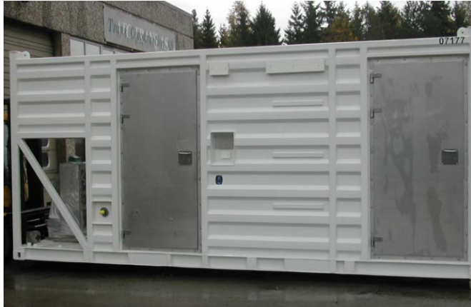
External view of container