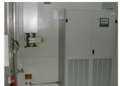
Ventilation supply and VSD Cabinet

2 x 100% air cooled condensers and the supply fan are mounted externally on the end section of the container.